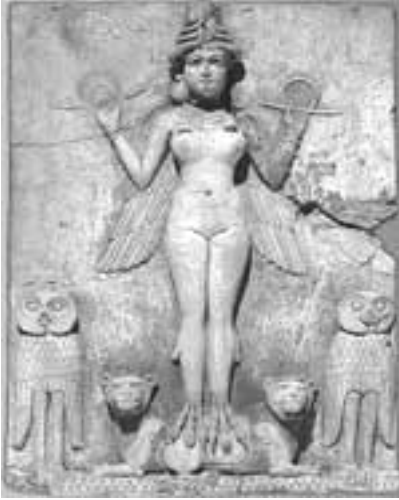
Figure 2.2 Queen of the Night Circa 1800-1750 BCE. Also known as The Burney Relief.

Ereshkigal's underworld was called Erkalla and it was considered a world from which there was no return. It was known as the Land of the Dead. However, over time Ereshkigal is separated from the Sumerian triad of the original three beings and fragmented into a variety of facets of the same original force.