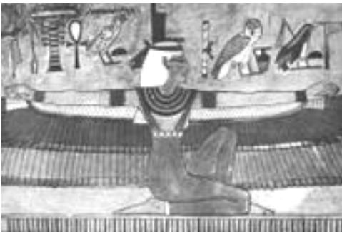
Figure 2.3: Wall painting of the goddess Isis. Circa 1360 BCE.

On the delta of the Nile, the ancient Egyptians called their goddess of the underworld Isis. In accordance with their views on the afterlife, they deemed her “Underworld Mistress of the House of Life.” The stories in the Book of the Dead speak of her as she who knows the orphan, knows the widow, seeks justice for the poor, gives shelter for the weak, the goddess of magic, and the lady of the words of power. Isis is the sister-wife of Osiris, lord of the underworld, and the mother of Horus (similar to Eris' son Horkos in the Greek myths). To the Egyptians, she was the feminine principle embodied as wife and mother and mistress of magic. Earliest depictions associate her with a throne, an ankh, eagles, vultures, and owls (figure 2.3).