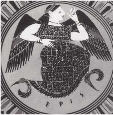
Figure 2.1 Winged Eris Antikensammlung Museum Collection, Berlin. Circa 575 - 525 BCE. Eris is depicted as a goddess with winged shoulders and feet.

Apparently her size belied her might, as Homer writes in the Illiad “Eris (Hate)...she who is only a little thing at the first, but thereafter grows until she strides on the earth with her head striking heaven. She then hurled down bitterness equally between both sides as she walked through the onslaught making men's pain heavier.” 5 In Works and Days Hesiod tells us “[Eris] is hateful ... [she is the one] who builds up evil war, and slaughter. She is harsh; no man loves her, but under compulsion and by will of the immortals, men promote this rough Eris (Strife).” 6