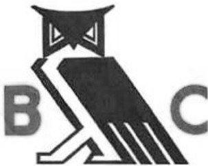
Figure 5.4. Moloch - the owl logo of the Bohemian Club.

Towering forty feet above a black altar is the main attraction of the macabre Bohemian Club – the giant stone owl called the Owl of Bohemia. As we have seen, the owl has been described as the guardian of the goddess of the underworld since ancient times. This owl – called “Moloch” - is the symbol and logo for the Bohemian Club (Figure 5.4). Moloch is the Babylonian-Cannanite deity to whom children and adults were sacrificed. Widows of former Bohemian Grove members (who most likely were not keen on their husbands’ summer camp with the boys) report that their husbands were obsessed with owls and had little owl statues all over their houses. Little wonder now why the owl appears on buildings and state capitols all over the United States and even hides on the dollar bill.