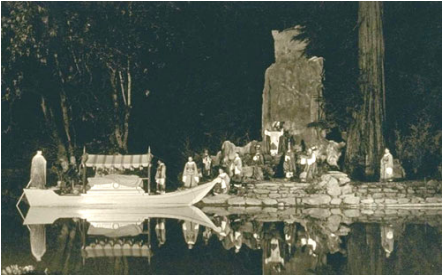
Figure 5.3 Photograph of the Cremation of Care ceremony.

Towering forty feet above a black altar is the main attraction of the macabre Bohemian Club – the giant stone owl called the Owl of Bohemia. As we have seen, the owl has been described as the guardian of the goddess of the underworld since ancient times. This owl – called “Moloch” - is the symbol and logo for the Bohemian Club (Figure 5.4). Moloch is the Babylonian-Cannanite deity to whom children and adults were sacrificed. Widows of former Bohemian Grove members (who most likely were not keen on their husbands’ summer camp with the boys) report that their husbands were obsessed with owls and had little owl statues all over their houses. Little wonder now why the owl appears on buildings and state capitols all over the United States and even hides on the dollar bill.