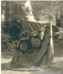
Figures 5.1 – 5.2. Photographs from Bohemian Grove.