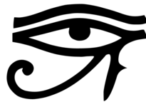
Figure 2.4: The Knot of Isis. Figure 2.5: The fleur-de-lis . Figure 2.6: The Eye of Ra.

Part of the reason that the Knot of Isis is also known as the Blood of Isis could be a result of Isis’ assimilation of the Old Kingdom goddess Sekhmet. Sekhmet was the daughter of sun god Ra and was also known as the “Eye of Ra.” Again we see the image of the lion, as Sekhmet is depicted with the head of a lioness and the body of a woman. Sekhmet was the goddess of divine retribution, vengeance, and conquest and was widely associated with destruction. She is also associated with battle, specifically as pre-emptive strikes